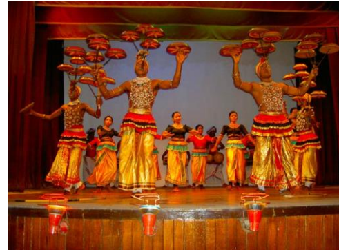
Kandyan Cultural Show

Continue your drive to Kandy and check in at your hotel (2.5 hrs drive), check in to the hotel. Late afternoon witness a Kandyan Cultural Show .