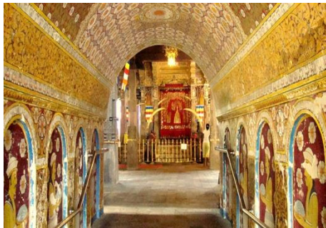
Sacred Temple of the Tooth

Sacred Temple of the Tooth was built during the 16th Century AD, it is one the most important temples for Buddhists as it houses the Sacred Tooth Relic of Buddha. The Relic of the Tooth is kept in a two-story inner sanctum. The 'Thevava' or auspicious offering to the Sacred Tooth Relic takes place three times a day at pre-set times and a visit during this time is quite an experience. The resident monks demonstrate this age-old tradition as you become surrounded by the sound of drums and the smells of lotus and jasmine flowers, as well as incense. In July and August the whole city comes to life as the Kandy Esala Perehara pageant takes place in honour of the Relic.