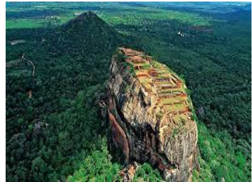
Sigiriya Rock Fortress

After a leisurely breakfast, proceed to Habarana enroute visit Sigiriya (4 hours drive). Late afternoon, climb Sigiriya Rock Fortress - a UNESCO World Heritage site, Sigiriya is an enormous rock boulder rising up 200 metres out of the surrounding jungle. It seems more astonishing with every step you climb. Pause occasionally during your ascent to admire the mirror wall, the sigiri graffiti, the famous Sigiriya frescoes and the great lion paws. Keep going until you reach the top and you'll immediately see that it was worth the effort. Wander