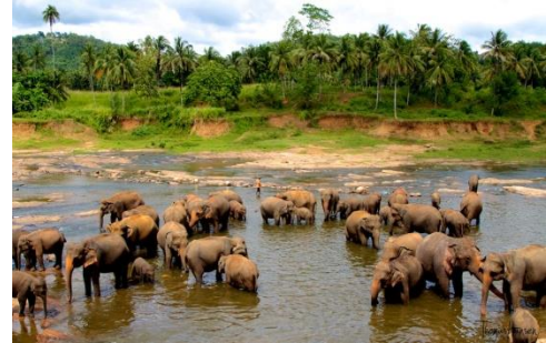
Pinnawala Elephant Orphanage

Today's adventure includes a visit to the Pinnawala Elephant Orphanage, a breeding ground and orphanage for wild elephants. The orphanage was founded in order to care and provide protection for the many injured and orphaned elephants stranded in the jungle. Start early and on arrival at the orphanage, watch the herd as they enjoy a breakfast of leaves and shoots. Next, have your camera ready as the excitable baby elephants enjoy a bottle feed. Before leaving, look on as the whole herd make their way through the town for bath time in the Maha Oya River.